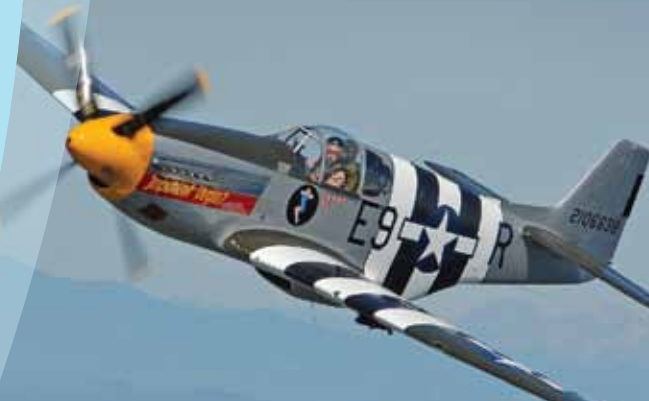
HISTORIC FLIGHT RESTORATION CENTER PAINE FIELD, EVERETT