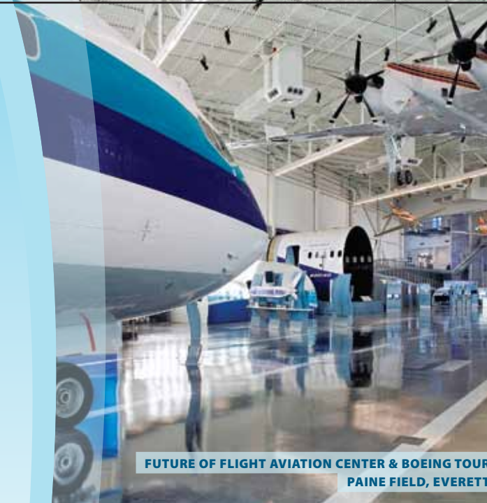
FUTURE OF FLIGHT AVIATION CENTER & BOEING TOUR PAINE FIELD, EVERETT

DISCOVER THE PASSION, INNOVATION AND POSSIBILITIES