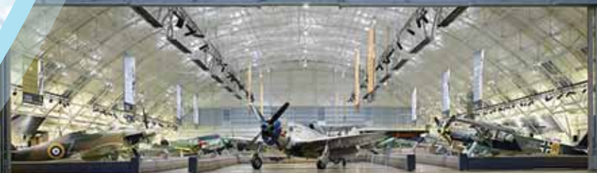
PAUL G. ALLEN FLYING HERITAGE COLLECTION PAINE FIELD, EVERETT